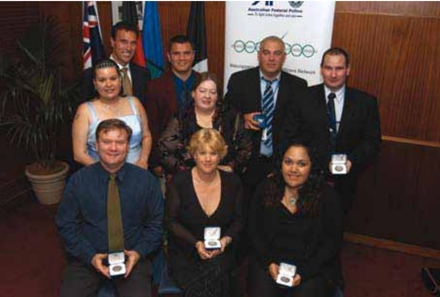
Left: MION members presented with the newly created MION Medallion.

Strait Islander descent, who are working in various capacities throughout our organisation.