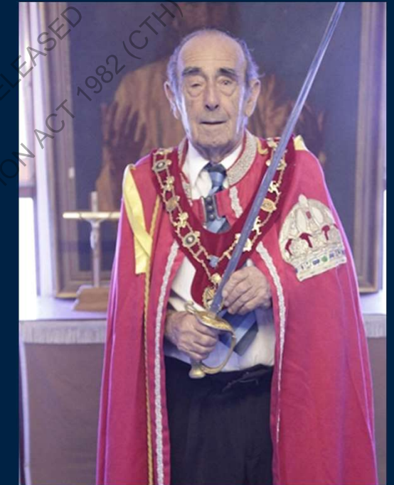
Hutt River's Self titled Monarch Prince Leonard