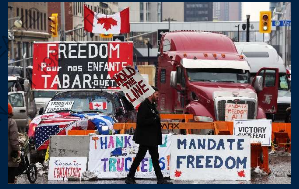
"Freedom Convoy" in Canada which inspired a number of movements globally, including in Australia.